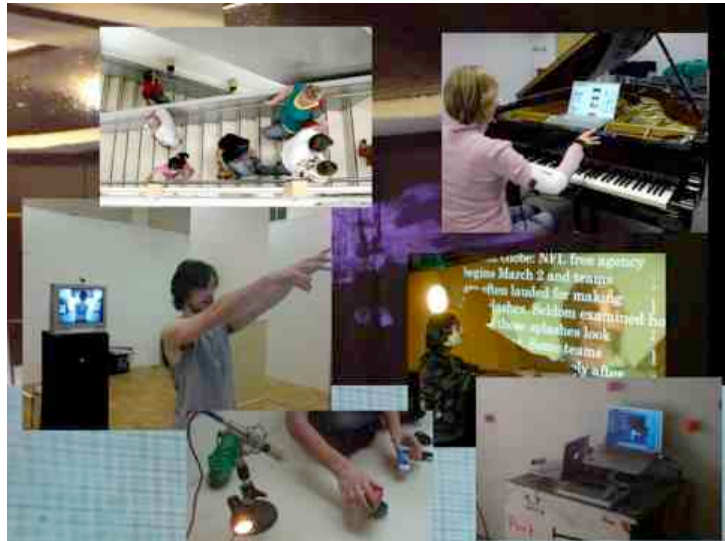
Recent VRU projects that have involved real-time data acquisition processes

CODA is based around the concept of the node. A node could be a computer, dancer, MIDI faders or a sensor interface. Nodes stream real-time performance information to a data pool which all nodes have simultaneous access to.